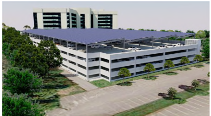
Quincy office rendering

We are growing video and conferencing capabilities to avoid travel to and between our offices.