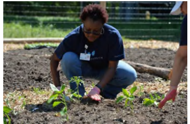
Corporate garden in Hingham

100% of our cafeteria wares are 100% compostable from plate to fork to cup to napkin.