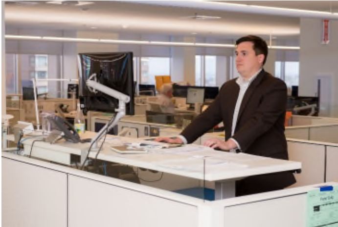
Our 101 Huntington office

2020 Goal: 30% reduction in absolute greenhouse gas (GHG) emissions